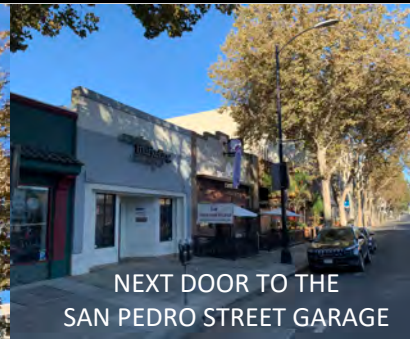
NEXT DOOR TO THE SAN PEDRO STREET GARAGE