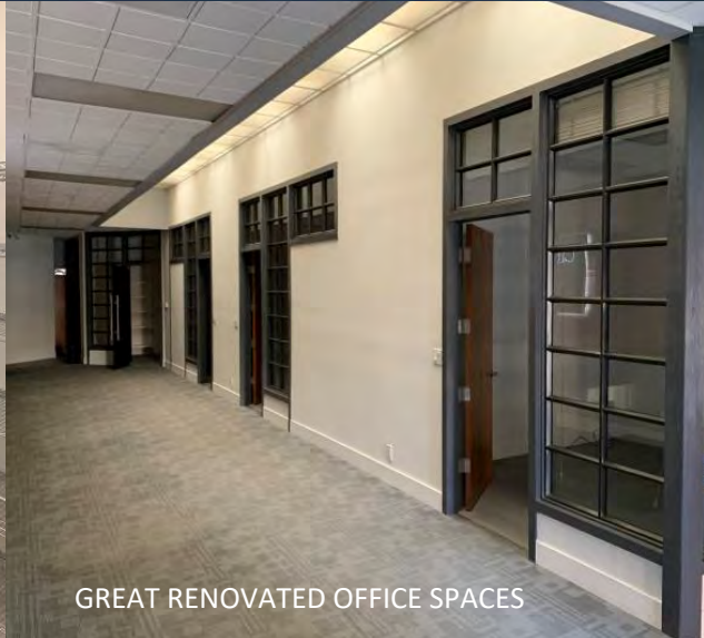
GREAT RENOVATED OFFICE SPACES