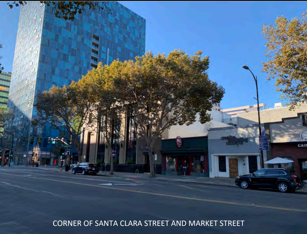
CORNER OF SANTA CLARA STREET AND MARKET STREET