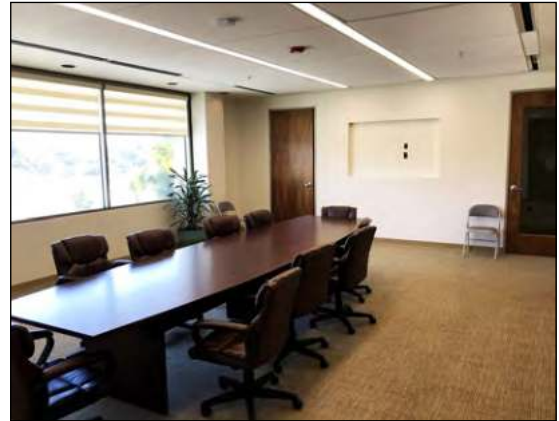
Shared Conference Room