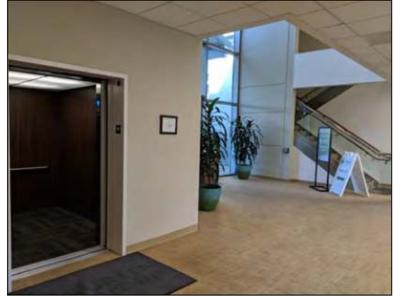
Entry and Lobby 2nd Floor Access via Stairs or Elevator