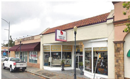
OUTER VIEW 1