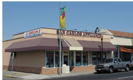
OUTER VIEW 2